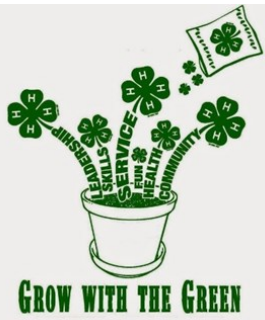
Exhibit Day Info!

The 2017 Kiowa County Fair Exhibit Day will be at the Community Building on Monday, Aug. 7th! Our theme this year is : "Grow With The Green!" .