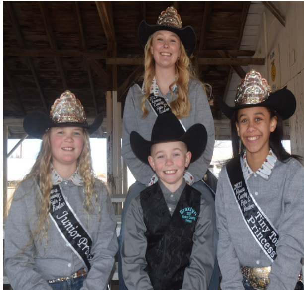
Royalty Pictures taken by Tabatha Ferris