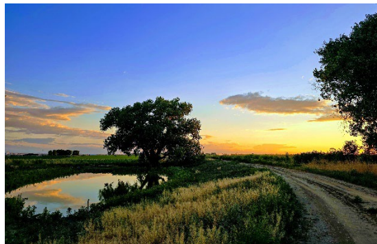
2024 Senior Grand Champion