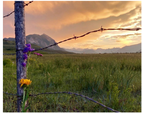
2024 Junior Grand Champion